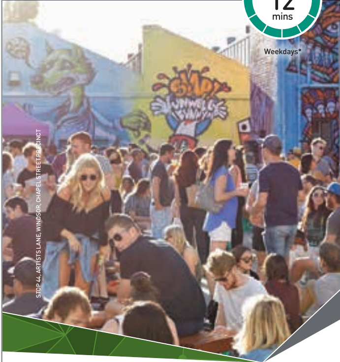
STOP 44, ARTISTS LANE, WINDSOR, CHAPEL STREET PRECINCT